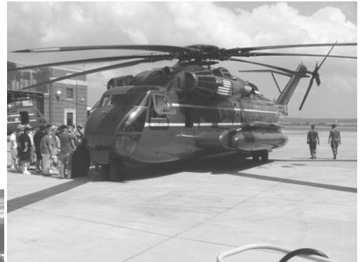
Visiting HMX-1, the President's Helicopter Squadron

Marine Barracks (8 th & 'I') and then spent the evening watching the famous silent drill team and listening to the Marine Corps Band.