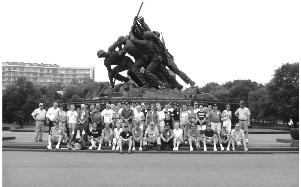
11 th Engineer Battalion at the Marine Corps War Memorial, Arlington Cemetery

In addition to touring many of the facilities housed on the Quantico Marine base, major memorials in Washington, DC were visited and an evening with the Commandant of the Marine Corps at the Marine Barracks (Eighth and 'I') was enjoyed by all.