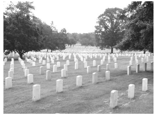
Paying respects - Arlington National Cemetery