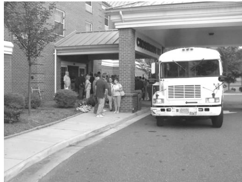
Tour transportation was provided by the United States Marine Corps

Our tour of Washington included Arlington National Cemetery, the Marine Corps (Iwo Jima) War Memorial, the Vietnam Wall, the Korean and World War II memorials and the Smithsonian Museums. The day was topped off when we had dinner at the