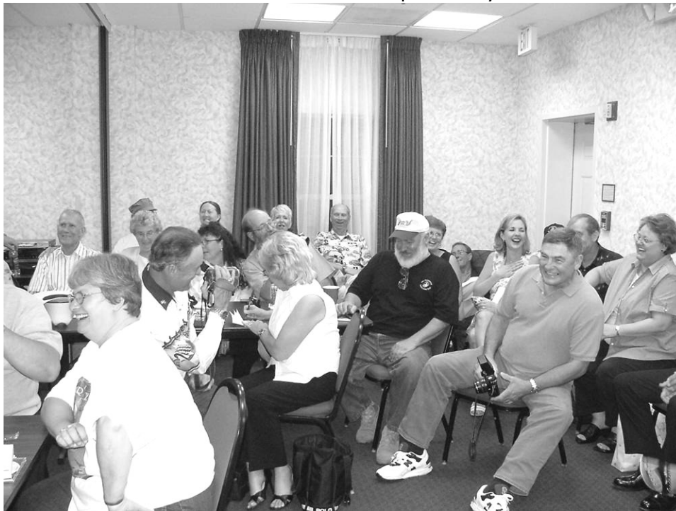
Business meeting on 28 August

Please welcome them in their new responsibilities and direct any battalion business related information to the appropriate officer.