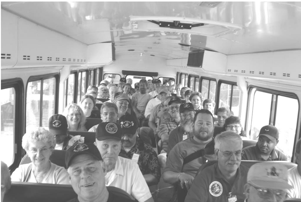
On the bus to Washington - 27 August